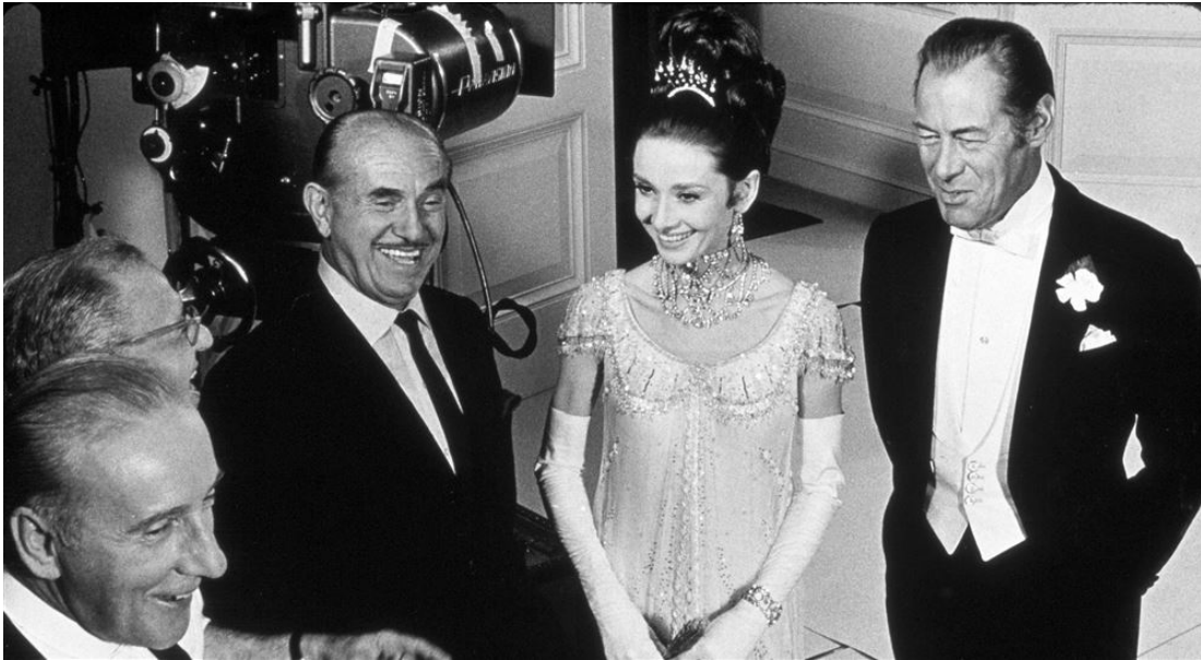
The documentary "Jack L. Warner: The Last Mogul" will be screening during the 2023 JFilm Festival.