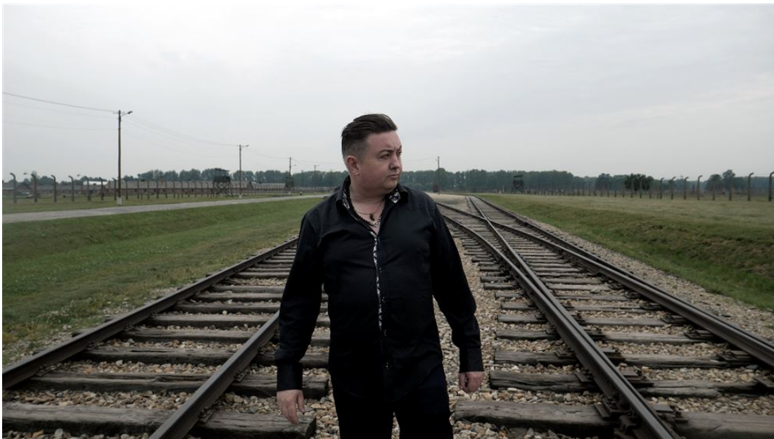
The documentary "The Cure for Hate: Bearing Witness to Auschwitz" will be making its world premiere during the 2023 JFilm Festival.

“Pittsburgh Ballet Theatre has had a long commitment to using dance to bring light to difficult issues and histories,” McKinney said in an emailed statement. “Our artists’ involvement in ‘Finding Light’ exemplifies the company’s continued dedication to telling stories of redemption and repair. We are proud to partner with the JFilm Festival on this important and powerful project.”